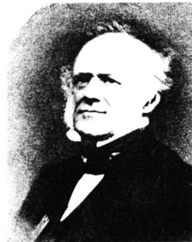
Figure 2 Sir Charles Lyell, 1797-1875.