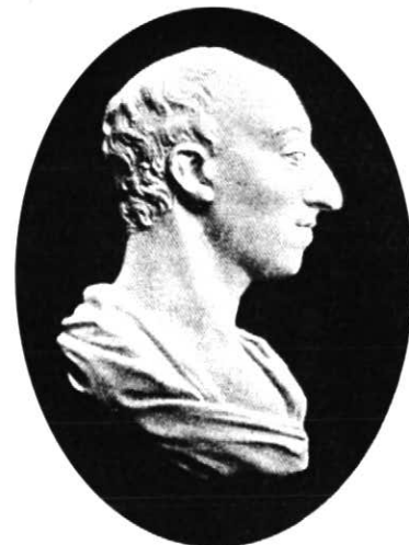
Figure 1 James Hutton, 1726-1797.