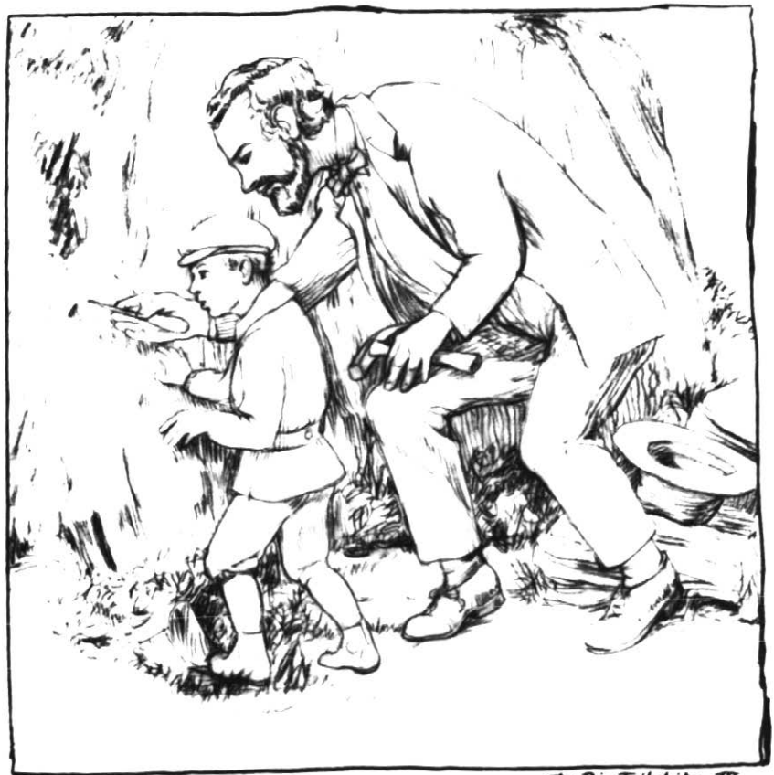
The Big Trilobite III M. Colbert © 1992