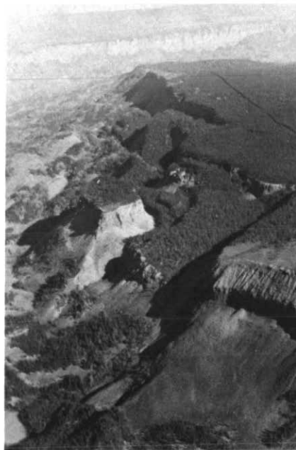
Figure 4 Oblique aerial view to the northeast along a 4 km sector of the south rim of Ship Creek valley. The Ship and its adjacent slumped sandstone masses are strikingly evident.

A stability analysis has been performed, which indicates that the observed failures can be explained on the basis of deep-seated planar sliding with residual friction angles of the order of 10^{\circ} . The most likely mechanism involves sliding on a sub-horizontal plane located near the base of the Garbutt shales, approximately 300 to 400 m beneath the top of the Bulwell sandstone.