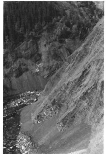
Figure 5 Back-tilted shale and siltstone strata of the Lower Cretaceous Garbutt Formation in a downstream view along Ship Creek. The beds on the right bank dip approximately 20^{\circ} to the southeast; beds to the left dip at a similar angle in an opposite direction. Near-vertical beds striking parallel with the stream course have been observed on the channel floor nearby.