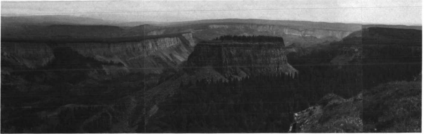
Figure 3 North-northeast view down the valley of Ship Creek towards the Scatter River. The concordant surface of this portion of the Alberta Plateau is formed by the Lower Cretaceous Bulwell member sandstone of the Scatter Formation.

landslides could be described as lateral spreading failures.