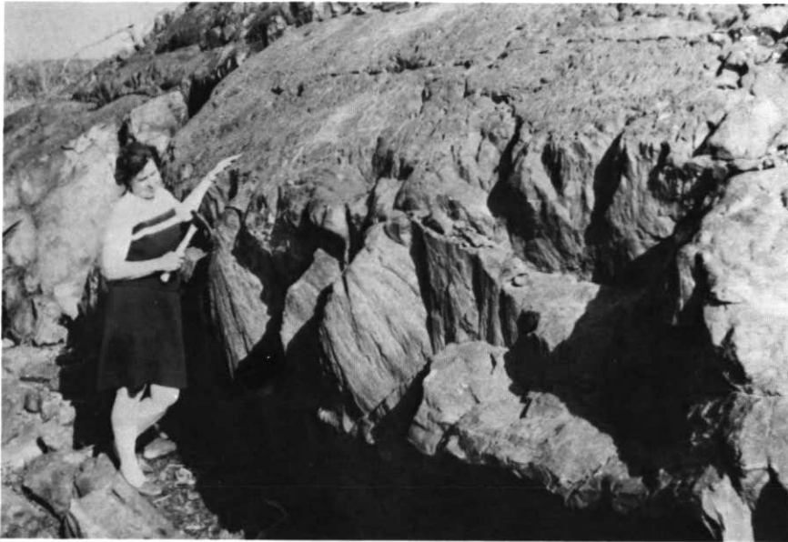
Figure 2 Large shatter cones in Mississagi quartzite at type locality, Kelley Lake, south of the Sudbury Basin.