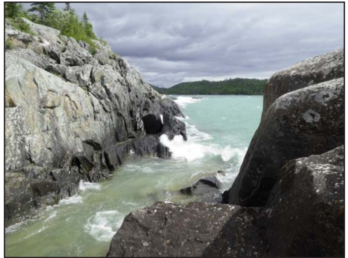
Pukaskwa dyke (~ 1106 Ma) intruded along plane of weakness in deformed Archean pillow basalt (in left cliff face).

This field trip will focus on ca. 1140–1105 Ma volcanic and intrusive rocks related to the Early Midcontinent Rift, emplaced onto or into the Archean terrane northeast of Lake Superior. Because we are virtual, we can visit many of the best outcrop exposures located off the beaten path, from the spectacular Lake Superior shoreline to as far east as Timmins. We will look at a very diverse range of alkaline and tholeiitic igneous rocks with planned stops at: 1) Chippewa Falls and Mamainse Point to see pahoehoe lava flows and interflow conglomerates, 2) Rift perpendicular dykes including the Great Abitibi and Kipling dykes, 3) Rift parallel alkaline dykes in Pukaskwa National Park, 4) interlayered alkaline and tholeiitic basalt at Penn Lake, 5) the Coldwell Complex, the largest alkaline intrusion in North America, to see partial melting at the Archean footwall contact and classic intrusive relationships between nepheline syenite and alkaline gabbro at Neys Provincial Park, and 7) Pebble beach in Marathon. We will finish the field trip by examining some of the highly unusual but distinguishing igneous textures at two of the best-known copper-palladium deposits located in the eastern Midcontinent Rift, i.e. the Geordie Lake and Marathon deposits within the Coldwell Complex.