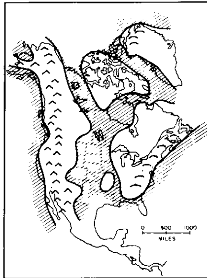
Figure 1 Distribution of the Late Cretaceous mid-Campanian seas in North America. Note the proposed extension of the Western Interior seaway to Western Greenland through Hudson Bay, Hudson Strait, Davis Strait, and Baffin Bay (Alter Williams and Stelck, 1974).

An important step towards refining the Cretaceous time-scale has been taken by J. D. Obradovich and W. A. Cobban of the USGS, who integrate radiometric ages obtained from bentonites (altered volcanic ashes) using the K/Ar chronometer with some of the 60 (mainly) molluscan zones now recognized in the Upper