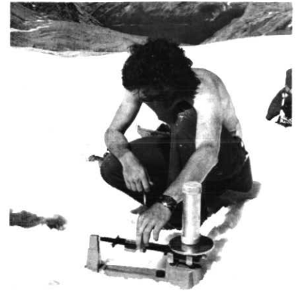
Figure 1 Snow density determination, Peyto Glacier.