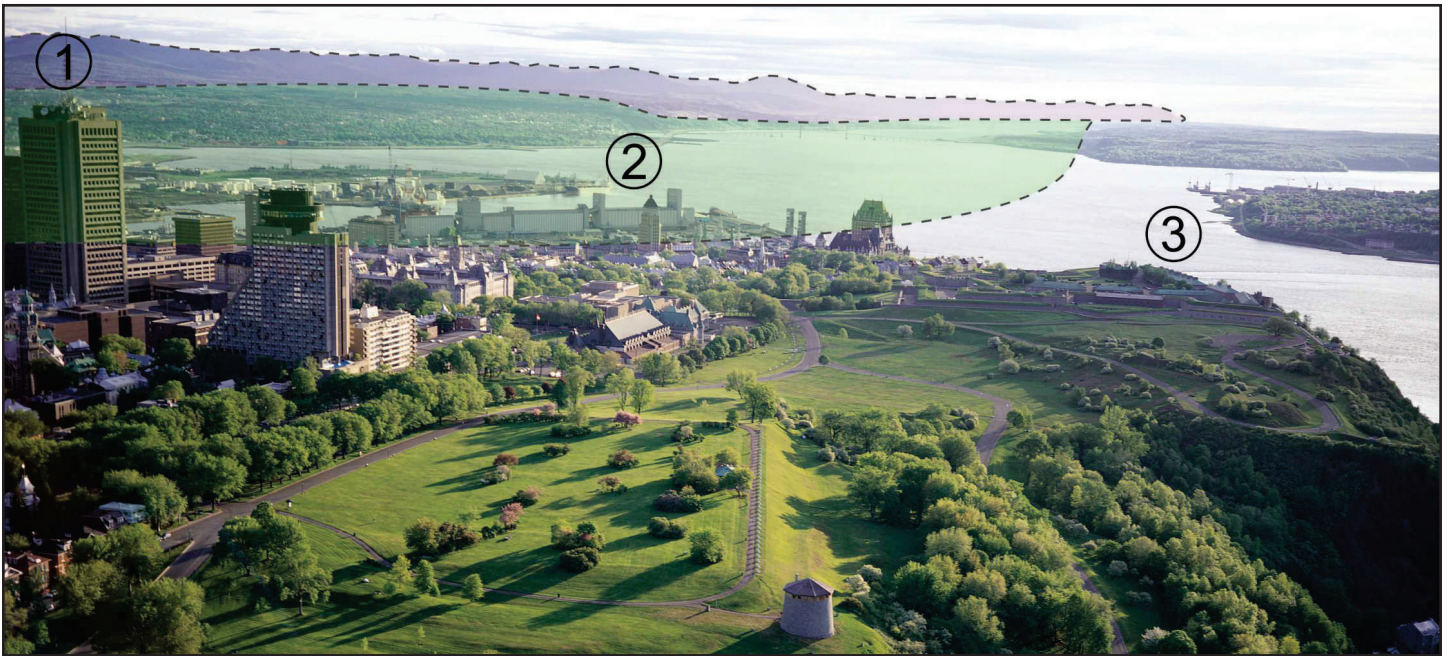
Figure 2. Panoramic view of the reliefs associated with the three geological provinces in the Quebec City area. 1- Canadian Shield/Grenville province; 2- St. Lawrence Lowlands/Platform; 3- Appalachians.

and present the stratigraphy and architecture of the Late Quaternary sediments hosting these aquifer systems, most notably the large paleo-deltas deposited by meltwater-fed rivers along the northern margin of the Champlain Sea and the glacio-fluvial/marine sediment bodies associated with the Saint-Narcisse Moraine and emplaced below the Champlain Sea limit in the St. Lawrence Valley.