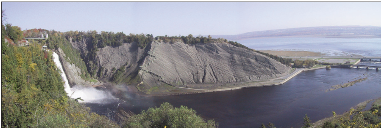
Figure 1. Panoramic view of the transition between the Precambrian gneisses, Ordovician carbonate and clastic foreland units, Montmorency Falls.

The one-day field trip entitled " Champlain Sea deltas and the St-Narcisse Moraine in the Portneuf and Mauricie regions of southern Québec: 3-D stratigraphic modeling and regional aquifer systems ", led by Michel Parent (GSC-Québec) and colleagues, will be of particular interest to quaternary- and hydro-geologists, and set the table for multiple groundwater-related special sessions. West of Québec, the Portneuf and Mauricie regions host some of the largest, most productive and widely used granular aquifers in southern Québec. Over the last 20 years, these aquifer systems have been extensively investigated in a series of studies ranging from 3-D stratigraphic models to groundwater flow modelling. The field trip will introduce participants to the regional groundwater systems of this part of the Laurentian foothills