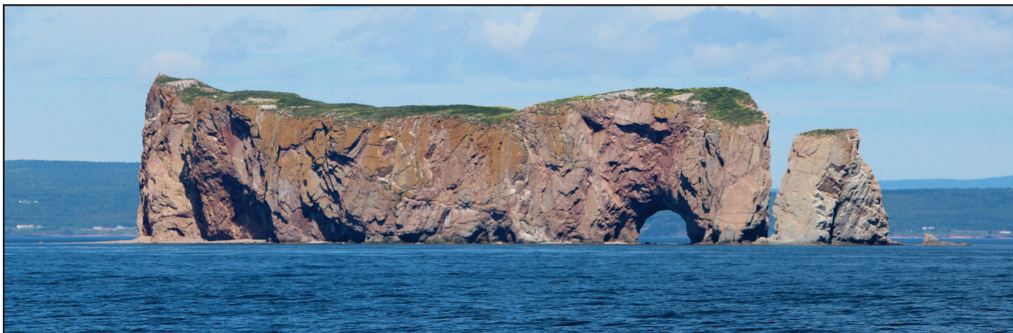
Figure 3. Rocher Percé, Quebec, part of the Percé UNESCO Global Geopark.

text ?. Participants will visit the critical localities of the stratigraphy and the structural characteristics of the ophiolite complex, with a particular emphasis on pre- to syn-obduction structures and associated lithological variations in the crustal section of the ophiolite, and its overlying sedimentary cover. The trip will visit major lithological facies constituting the ophiolite complex: mantle, plutonic crust, boninitic lavas and dykes, chromitites, and hydrothermal systems. The excursion will examine pre-obduction synmagmatic structures that are attributed to fore-arc seafloor spreading, syn-obduction structures and facies (dynamothermal aureole and sole, intra-mantle granitoids, piggy-back basin sediment), as well as post-obduction overprinting structures related to both the Salinic and Acadian orogenies.