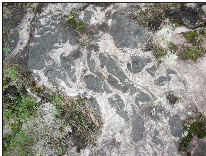
Figure 4. Magnetite-apatite-clinopyroxene segregation in Na–K- altered Lyon Mountain Granite host rock, Rutgers Mine; displaying possible evidence for magma mixing.