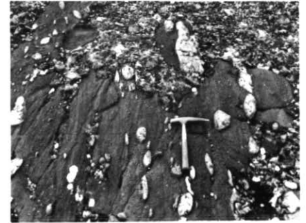
Figure 2 A conglomerate from the upper part of the Isua complex. The boulders and pebbles appear to be fine to medium grained acid volcanic fragments with a relatively high potassium content. The matrix contains quartz, microcline, plagioclase, carbonate and biotite.

material such as granite would survive from the earliest part of Earth history unless they had been very extensive and that a major part of the silic material now found in the continental crust differentiated in the first 500 to 800 m.y. of Earth history. The universal field observation that the major Archean granites intrude the margins of the greenstone belts says nothing