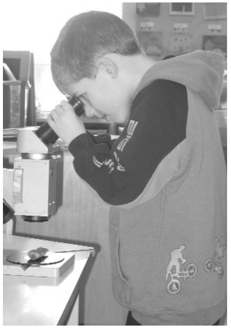
Figure 3. Student viewing a coprolite using a binocular wellsite microscope.

Calgary Board of Education (CBE) kindergarten classes range in size from about 17 to 26 students, with a teacher and one or more aides. Most classes have a fairly equal mix of boys and girls with both sexes being very inquisitive about science at this age. When you ask for volunteers to come up to the front of the class there are always a lot of