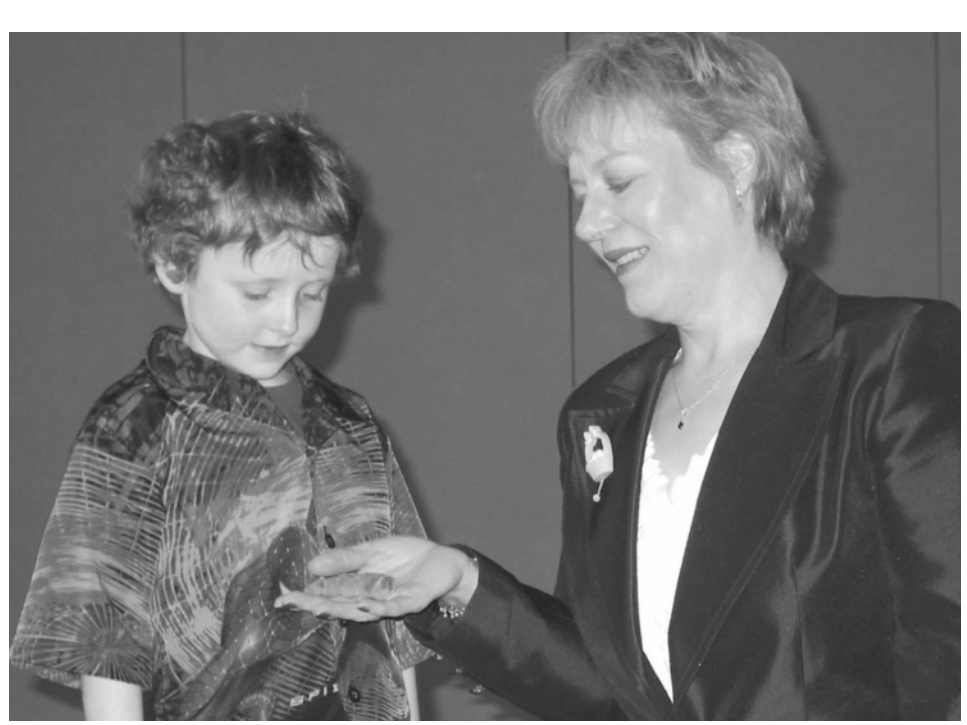
Figure 4. Student listening to the teacher and asking questions about coprolites.

The hunt to find good photographs of dinosaurs can be difficult because of copyright issues. However,