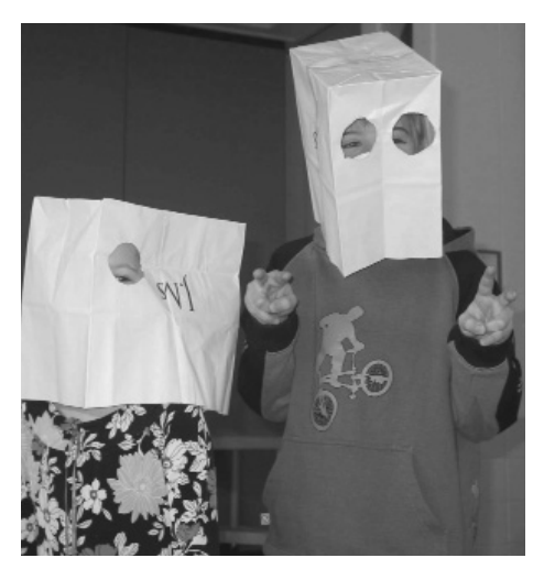
Figure 2. Students in dinosaur hats illustrating how carnivore and herbivore eyes are positioned differently on the skulls.

in which two holes are cut in the sides to mimic how a herbivore dinosaur would have seen the world. A boy volunteer is asked to put on a similar bag but with two holes cut into the front to illustrate how Tyrannosaurus viewed the world. Each student is asked to look at the other and the class shown that predator and prey had different skull shapes to help see, or watch out for each other. The point is then reinforced by showing pictures of dinosaurs' skulls and asking if they were herbivores or carnivores.