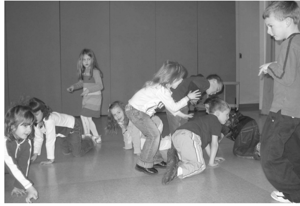
Figure 1. Students walking like dinosaurs. Note that the two-legged dinosaurs have three long "fingers".

The concept of, "how dinosaurs saw," can be illustrated using the concept of eye location on the skull. To show this, two volunteers can be brought to the front of the class. A girl, as in Figure 2, is asked to put on a paper shopping bag