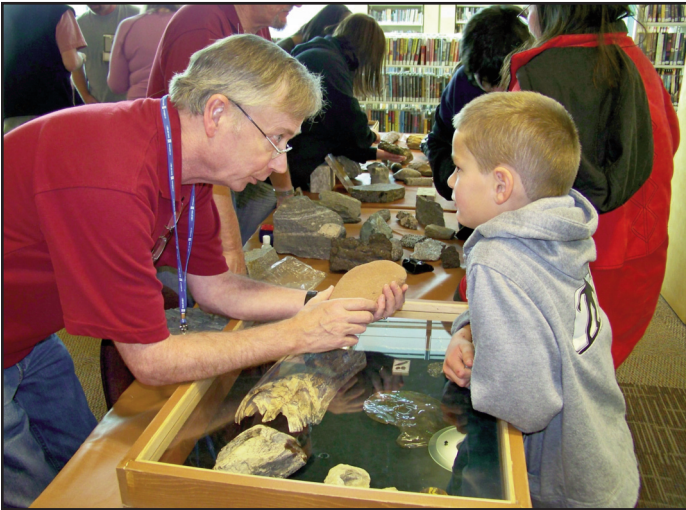
Figure 1. Interactions with earth scientists, focused on discussions of actual geological specimens, are key elements to the success of the Rock ‘n’ Fossil Road Show.

adapted by other research institutions interested in fun and effective public educational outreach programs.