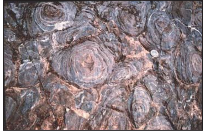
Figure 3. Outcrop of the stromatolite Archaeozoon acadense in the Green Head Group on Green Head Island.

Although some aspects of this new scenario are compelling, a number of questions remain. For example, Neoproterozoic magmatism in both the New River and Caledonia terranes occurred in two distinct pulses, one at ca. 625 Ma and one at ca. 555 Ma. Is this magmatism related? What is the significance of fossiliferous Cambrian rocks with Atlantic-type fauna in the New River and Brookville terranes? Are they part of the Saint John Group, representing the Avalonian cover sequence in the Caledonia terrane? If so, what are the implications for Ganderia versus Avalonia? Why are the Silurian arc-related volcanic rocks of the Kingston Group and adjacent high-