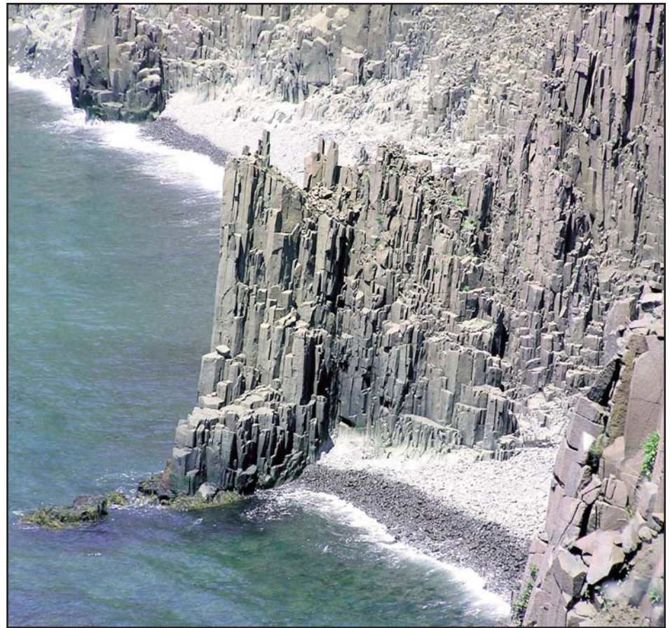
Figure 4. Colonnades in the Triassic Dark Harbour Basalt.

Participants are limited to 25 people and while on the island will travel together by shuttle bus. The field trip fee includes bus transportation from Fredericton to Blacks Harbour on Friday, the shuttle bus, ferry travel on foot both ways, bag lunches both days, dinner at the Inn on Saturday evening, and bus transportation from Blacks Harbour to Fredericton on Sunday afternoon. Accommodations and other meals are extra and the participant's responsibility, however, participants are encouraged to stay at the Marathon Inn in North Head ( http://marathoninn.com/ ; 506-662-8488 or toll free 888-660-8488) where the trip will be based. Please be sure to reserve your room well in advance, as bird watchers flock to Grand Manan in May. Alternate accommodations are available at the Surfside Motel (506-662-8156), located about 1.5 km from the ferry terminal, or at one of several B & B's in the area.