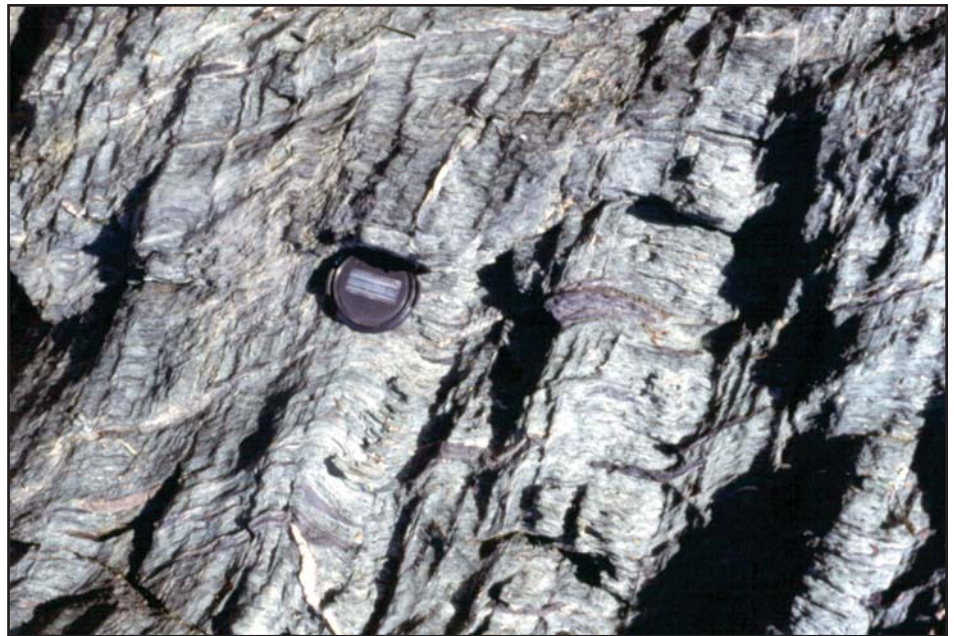
Figure 1. Schistose mafic volcanic tuff of the Neoproterozoic Ingalls Head Formation.

This two day, post-conference field trip will visit shoreline exposures on the scenic Island of Grand Manan, located in the Bay of Fundy off the south-western coast of New Brunswick. Grand Manan is unique in Atlantic Canada in displaying the geological features of both the ancient Gondwanan margin of the Paleozoic Iapetus Ocean and the Mesozoic margin of the modern Atlantic Ocean. The eastern part of Grand Manan is underlain by complexly deformed sequences of volcanic (Fig. 1) and sedimentary rocks (Figs. 2, 3), the ages of which have only recently been determined by geochronological analyses. This field trip will examine