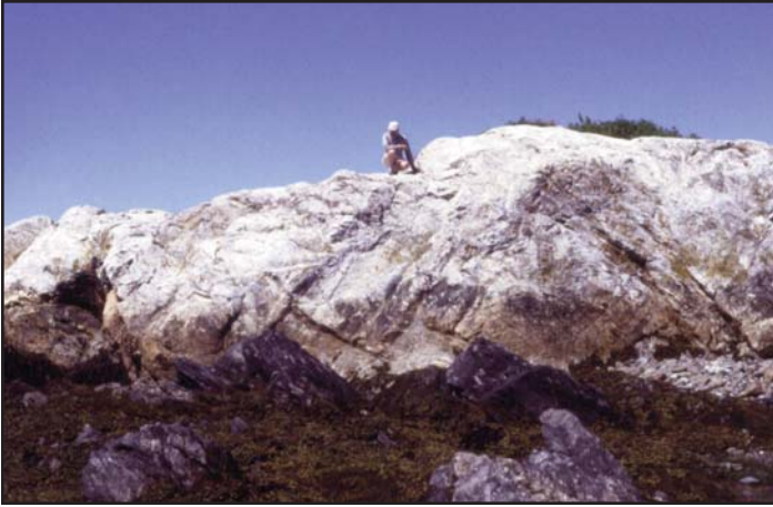
Figure 2. Massive quartzite of the Mesoproterozoic Thoroufare Formation.