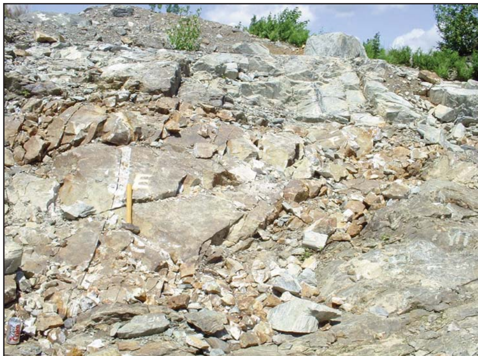
Figure 1. Three metre wide auriferous quartz vein exposed in a trench at the Main Zone of the Clarence Stream deposit.

is a structurally controlled, intrusion-related gold deposit situated near the terrane-bounding Sawyer Brook Fault Zone that separates the Ordovician St. Croix Terrane from Silurian metavolcanic and metasedimentary rocks. These volcano-sedimentary rocks have been intruded by several generations of gabbroic and felsic dykes in a structural corridor that parallels the northern margin of the Early Devonian Maga-guadavic Granite. Two major zones of mineralization are recognized at this deposit: (1) auriferous quartz veins that occupy a northeast-trending brittle-ductile shear zone (Fig. 1) cutting deformed gabbroic, granitic, and sedi-