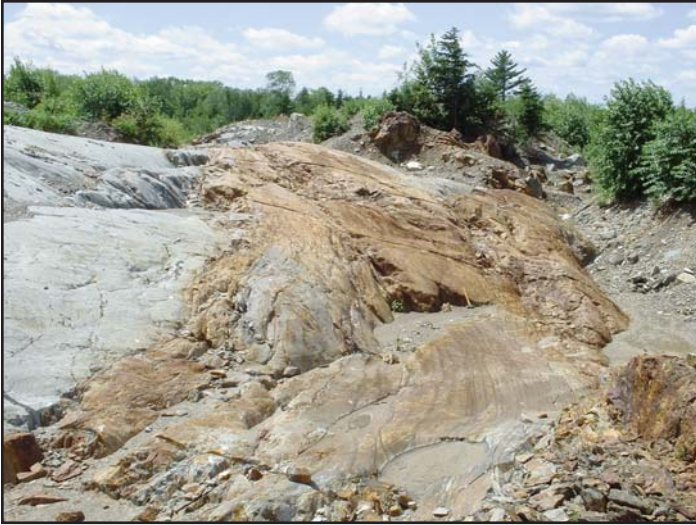
Figure 2. Large trench exposure showing metagabbroic rocks (left) in contact with rusty altered metasedimentary rocks (right) and cut by auriferous quartz veins, Clarence Stream deposit.