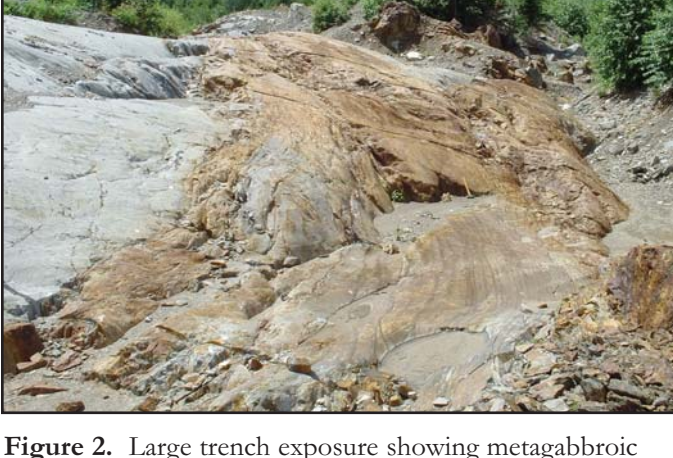
Figure 2. Large trench exposure showing metagabbroic rocks (left) in contact with rusty altered metasedimentary rocks (right) and cut by auriferous quartz veins, Clarence Stream deposit.