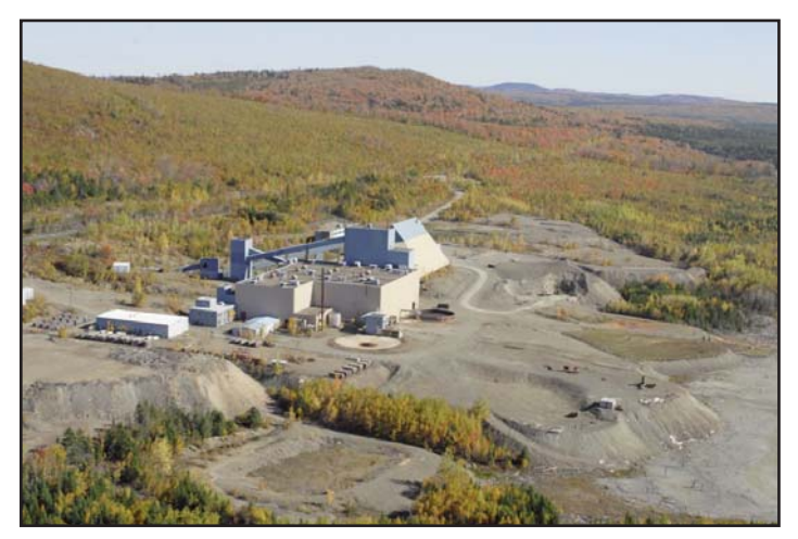
Figure 3. Aerial view of the Mount Pleasant Sn–W–Mo–Zn–In Mine, southwestern New Brunswick.

zones, 3) further characterize the nature of the deposit at depth, and 4) demonstrate evidence to support the source of the gold and the controlling factors on the mineralization.