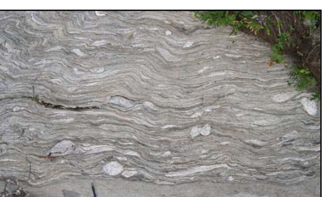
Figure 3. Polymictic conglomerate ('Timiskaming-type'), Wanipigow Fault.