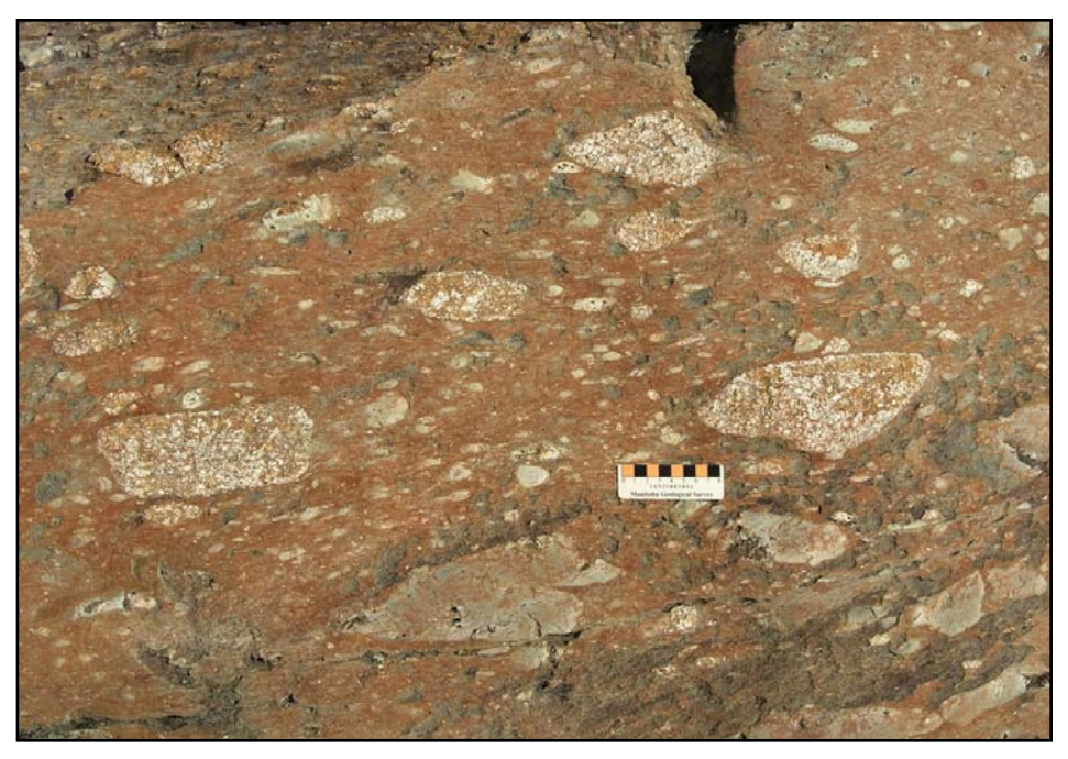
Figure 2. Intermediate volcanic conglomerate, Townsite unit.