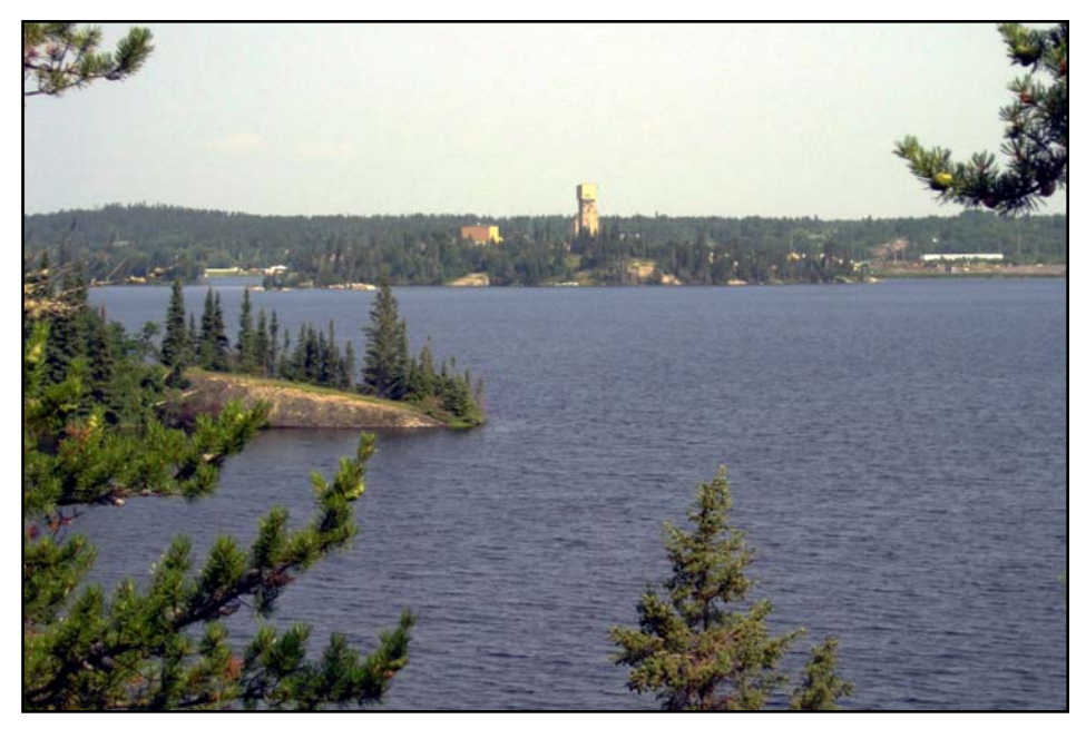
Figure 1. Rice Lake with the town of Bissett and the Rice Lake mine complex in background.

With a collective gold endowment of approximately 5 million ounces, the Rice Lake mine trend is the most significant lode-gold district in Manitoba. Clean bedrock exposures at Rice Lake (Fig. 1) provide an excellent opportunity to examine: 1) the character and stratigraphy of Neoarchean subaqueous effusive volcanic and vol-