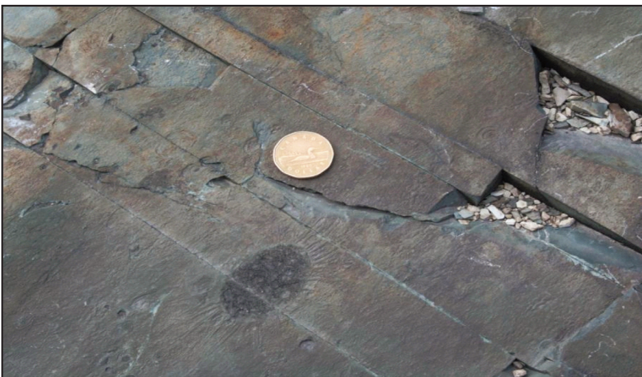
Hiemalora, Murphy's Cove, NL.

This trip will also include visits to sites of colourful historic and cultural significance, including the union-built town of Port Union; Cape Bonavista Lighthouse; Elliston, the 'Root Cellar Capital of the World'; King's Cove and numerous scenic