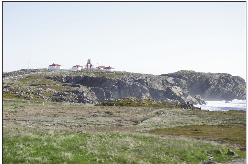
Cape Bonavista Lighthouse and the underlying cliffs, NL.

The Discovery Trail stretches along the Bonavista Peninsula in eastern Newfoundland and spans one of the most historic and beautiful parts of the province. This three-day field excursion will explore the coastal geological heritage of the region, and how its