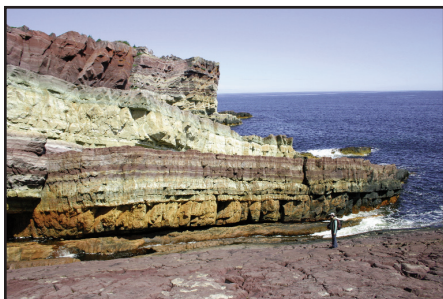
Multi coloured layers, Brook Point, Kings Cove, Bonavista Peninsula.

coves and communities spanning the coast.