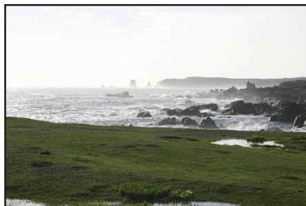
Sea stacks and heavy wave action, looking east from Dungeon Provincial Park, Cape Bonavista, NL.

the special session entitled, Preservation of Geological Heritage and Its Contribution to Education and Economic Development .