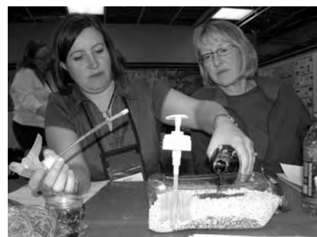
Figure 2. Teachers working on the groundwater system activity.