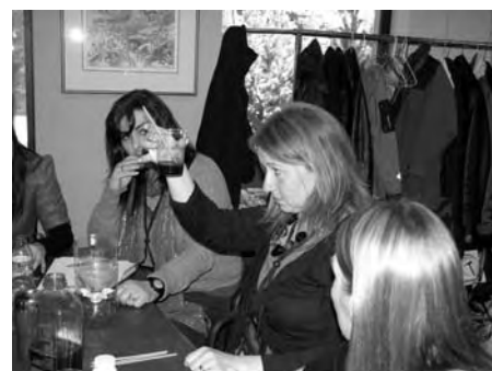
Figure 3. Teachers working on the water filtration activity.