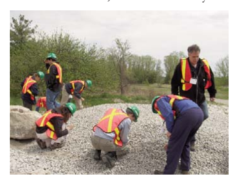
Figure 2. Teachers explore for fossils in Ordovician dolostone at Dufferin Aggregate's Milton Quarry.

http://geoscape.nrcan.gc.ca/index_e.p hp for information on the Geoscape posters and associated teacher materials across Canada]. Field trip leaders from the Ontario Ministry of Northern Development and Mines, and Prospectors and Developers Association of Canada Mining Matters provided an overview of the geological legacy of the GTA and introduced current geoscience issues of the region. Tours of the extraction, processing, and rehabilitation aspects of aggregate operations (Fig. 2) promoted awareness of the connection between geoscience and the wise use and management of land and resources. On-site, participants studied the importance of aggregates and teamed up to examine environmental problems, concerns, and solutions associated with aggregate operations. Teachers also had an opportunity to collect samples of fossiliferous dolostone, shale and gypsum from aggregate sites. Each field trip stop included the presentation of a curriculum-linked, hands-on activity