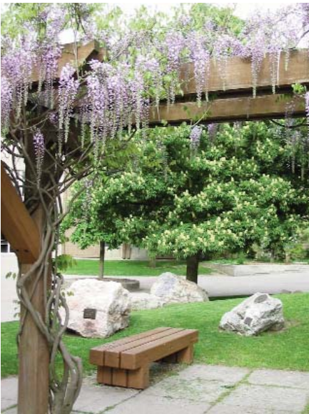
Figure 6. Peter Russell Rock Garden.

very large, ranging from 50 kg to 5 tonnes, and cover a vast span of geological history, from an Archean banded iron-formation boulder from Timiskaming, ON, to quartzite from Desbarats, ON that exhibits striae engraved by a Pleistocene glacier. The rock garden is also a popular spot for faculty, staff and student lunches and coffee breaks, allowing informal learning to take place.