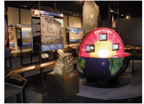
Figure 4. Dynamic Earth explained in Our Planet exhibit.

The pre-eminence of the sun and its influence on our planet are acknowledged; the rock and water cycles highlighted; weathering and weathering products shown; and mountain uplift depicted to continue the theme of Earth's dynamism (Fig. 4). Explaining the Earth's internal heat