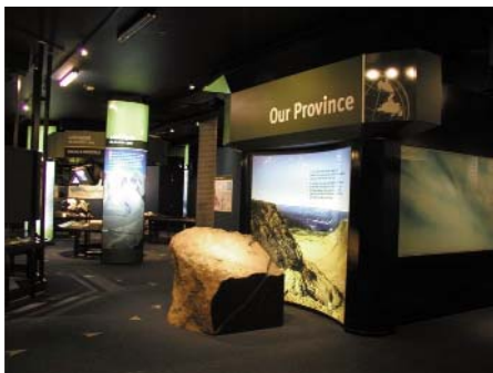
Figure 5. Entrance to Our Province exhibit. The block of rock at the start is a piece of obducted mantle from western Newfoundland.

It's no secret that Newfoundland is geologically renowned for its preservation and exposure of rocks that record the formation and closure of the proto-Atlantic or Iapetus Ocean . Spectacular coastal exposures and glacially scoured hilltops provide an unparalleled cross-section through continental margins, oceanic crust ( in situ and obducted), island arcs, back arcs, and sedimentary basins. Similarly, the magnificent exposures along the shorelines and barrens of Labrador are a boon to unravelling the mysteries of the Canadian Shield in eastern Canada. With some of Canada's oldest rocks (at nearly 4 billion years) in northern Labrador, and hydrocarbon-rich Mesozoic rocks underlying the continental shelf, the province's geology represents a significant swath of Earth history (Fig. 5).