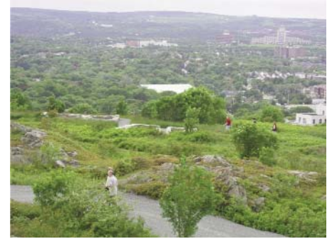
Figure 8. GEO PARK overlooks the city of St. John's. In the foreground are some of the PARK's trails, outcrops and stoneworks.