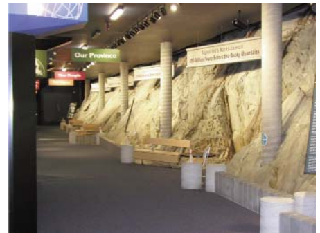
Figure 7. Exposed! GEO's sandstone walls bound the main Exhibits Gallery.

Returning to the Reception Hall from the Stellarium , one walks along the exposed, steeply dipping, bedded-sandstone walls of the GEO CENTRE (Fig. 7). Signage touts the antiquity of these rocks in relation to other seminal events in the geological evolution of the Earth and of Canada, e.g. the age of dinosaurs, and the birth of the Rocky Mountains. The walls are a magnet for children (although rock climbing is prohibited for safety reasons!), and various primary features developed on the bedding surfaces, as well as cracks and veins, get pointed out to visitors by GEO's interpretation staff. Arriving back in the Reception Hall, one has truly gained the impression that the GEO CENTRE is The Wonder Underground .