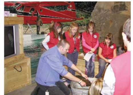
Figure 9. Panning for gold at a 'mineral exploration camp'.

Public Lectures are a free and regular feature at the GEO CENTRE, and those presented to commemorate the International Year of Planet Earth (IYPE) have been especially well attended (speakers have come from the St. John's geoscience community, the Geological Survey of Canada, and even internationally, e.g. Dr. Robert Ballard, scientist emeritus, Woods Hole Oceanographic Institute). The general public and students are also invited to a series of Special Events hosted by GEO throughout the year. These include Earth Day celebrations (featuring, for example, 'Stump a Geologist', 'Panning for Gold' (Fig. 9), and solar observations guided by members of the St. John's chapter of the Royal Astronomical Society of Canada); a bridge-building competition sponsored by National Engineering and Geoscience Week; and 'Doors Open St. John's', an event during which the GEO CENTRE and other museums and institutions in the city offer a free exploration of exhibits and facilities. Finally, GEO renews interest in its mission and complements its permanent galleries by hosting Travelling Exhibits , mostly during the off season. These are displayed in the Celestial Gallery, new space developed at the entry level and leading off the main entrance. Some of these temporary exhibits have enjoyed corporate sponsorship and helped generate valuable media interest. Exhibits hosted to date include: Dinosaurs and Company, From Crystals to Gems, and Arctic Adventure.