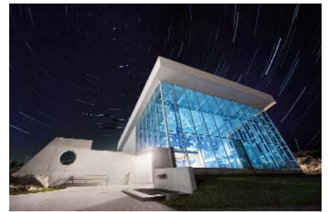
Figure 2. Portal to the Johnson GEO CENTRE.

by utilizing a sculpted glacial depression to construct the main body of the exhibit centre. Glacial debris was removed, and the revealed, striated, valley walls became the bounding walls (left exposed in the building) of the GEO CENTRE. Access to the exhibits would be through a glass-encased portal (Fig. 2) whose roof sloped downward toward the exhibit hall, which lay below the surface in the natural depression, inviting visitors to explore the Earthly delights below: The Wonder Underground was born!