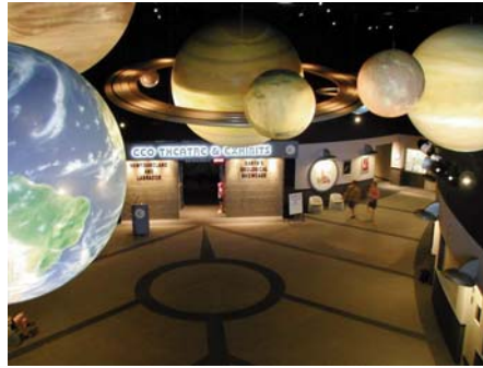
Figure 3. Reception Hall and Geo Theatre. The main Exhibits Gallery is behind the Theatre.

The presentation tells the story of the birth of the solar system through to the formation and evolution of Earth. During its showing, special effects in the theatre, including sound, light and music, dramatize