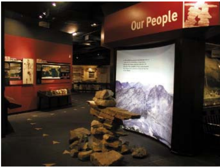
Figure 6. An Inukshuk greets visitors to the Our People exhibit. 'Lucy' is in the background.

of Europeans to the 'New World', beginning when Viking voyagers meet native North Americans in Newfoundland around 1000 C.E., human beings have completed a 'full circle' from their African birthplace.