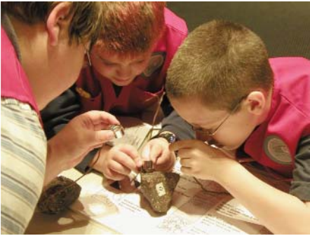
Figure 10. Accomplishing GEO's mission: turned on to Earth science!

dedicated volunteers (many are retired professionals), without whom the breadth and diversity of the GEO program would not be possible. Also, part-time interpreters, many of whom are MUN undergraduates, lead tours and help with classes. Indeed, it is the synergy between staff, volunteers, interpreters and visitors that makes the magnificence of Earth history, as depicted at the Johnson GEO CENTRE, come alive. Ward Neale would be proud! And so will you be when you drop by for a visit the next time you are in St. John's, Newfoundland.