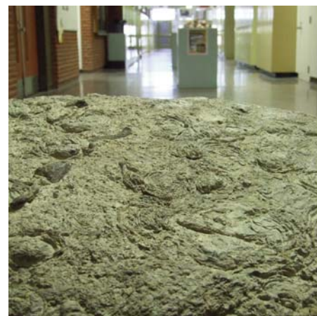
Figure 2. Stromatolite sample used to discuss blue-green algae.

Most mineral exhibits are presented in a traditional manner, i.e. with labels on individual mineral samples bearing information such as the mineral name, chemical composition, date of discovery, location, and donor's name. We believe we have reached a plateau using this type of presentation, because visitor interest saturates after 45 to 60 minutes of mineral description, history and uses. We also believe that simply showing more minerals will not get the general public more inter-