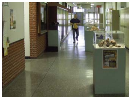
Figure 1. Petit musée displays in university corridor.

This traditional approach involves guiding visitors through different displays (Fig. 1) that present minerals from different localities from the province of Québec, the rest of Canada and from around the world. This locality-based classification is used to present the mineral samples so that visitors can relate minerals to a location they know or are familiar with (e.g. where a relative lives). However, this method does not work as intended, as