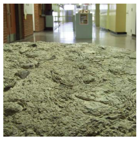
Figure 2 . Stromatolite sample used to discuss blue-green algae.

Most mineral exhibits are presented in a traditional manner, i.e. with labels on individual mineral samples bearing information such as the mineral name, chemical composition, date of discovery, location, and donor's name. We believe we have reached a plateau using this type of presentation, because visitor interest saturates after 45 to 60 minutes of mineral description, history and uses. We also believe that simply showing more minerals will not get the general public more inter-