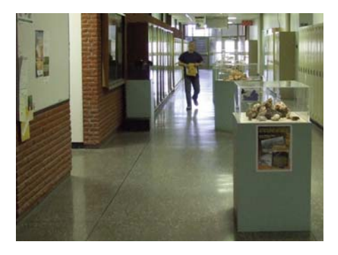
Figure 1 . Petit musée displays in university corridor.

This traditional approach involves guiding visitors through different displays (Fig. 1) that present minerals from different localities from the province of Québec, the rest of Canada and from around the world. This locality-based classification is used to present the mineral samples so that visitors can relate minerals to a location they know or are familiar with (e.g. where a relative lives). However, this method does not work as intended, as