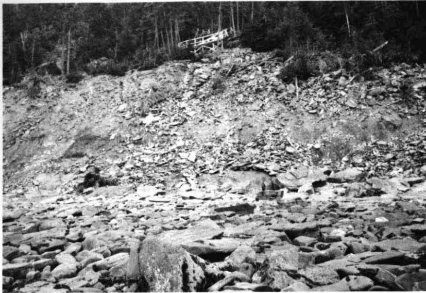
Figure 3 Gravity slide along purplish red shale member of Maringouin Formation, severely affected by marine erosion. The recently constructed wooden walk-way has in part been pulled apart as a result of sliding towards the bay.