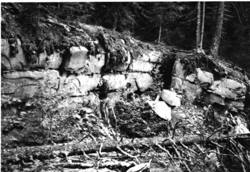
Figure 4 Effects of gravity sliding along parting surfaces (parallel to bedding) and offsets across joints, in Boss Point Formation.