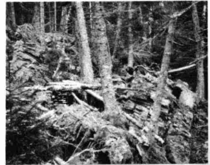
Figure 5 Effects of gravity sliding on vegetation.