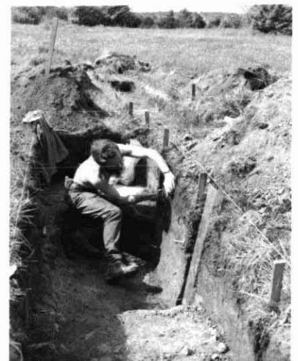
Figure 1 Soil sampling at an archeological site

The preservation of the remains of physical structure in the ground such as post holes, pits, and hearths, together with the artifactual material within soils, undoubtedly facilitates archeological interpretation, but perhaps even more important is the fact that the soils presently covering archeological sites also contain a chemical record of past human activities.