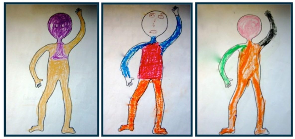
Figure 1. Sample student language portraits on template body silhouette. From Bridging Literacies Project (Prasad, 2008), Burkina Faso, West Africa.

through colourful drawings also helped to mediate language and cultural differences between the researcher and participants (Prasad, 2011). Upon reflection, however, I found that using one standard formatted body silhouette as the base for all teachers' and students' creations of self-portraits limited participants' affective connection with the process of selfrepresentation. Students, in particular, seemed to seek ways to personalize the body silhouette to make it a closer self-reflection by drawing in features such as eyes, hair, and clothes, in addition to mapping their languages and cultures (see sample portraits in Figure 1). Thus, in moving forward, I sought a medium that would engage participants more personally.