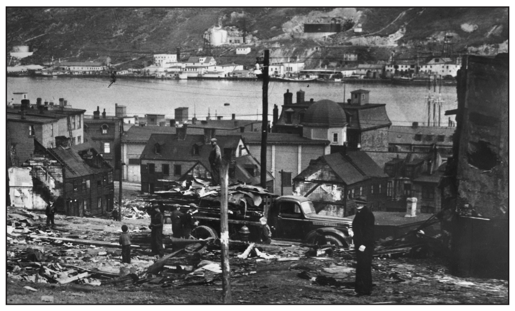
Figure 2 – Clearing the Area near Carter's Hill

The survey assessments outlined in this section provide an idea of what surveyors considered to be and not to be "good citizens." Good citizens were those individuals who were pleasant, forthright with their employment and financial information, who were currently or soon-to-be employed, married with children, and owning a decent number of household "effects" such as furniture. On top of these, gendered notions of citizenship were also included. Men were judged on the state of the house repairs and how much they drank, while women were judged on the cleanliness of the home and their "social mindedness." Thus "good citizenship" was a key criterion (at least during the survey) for obtaining a rental house or apartment.