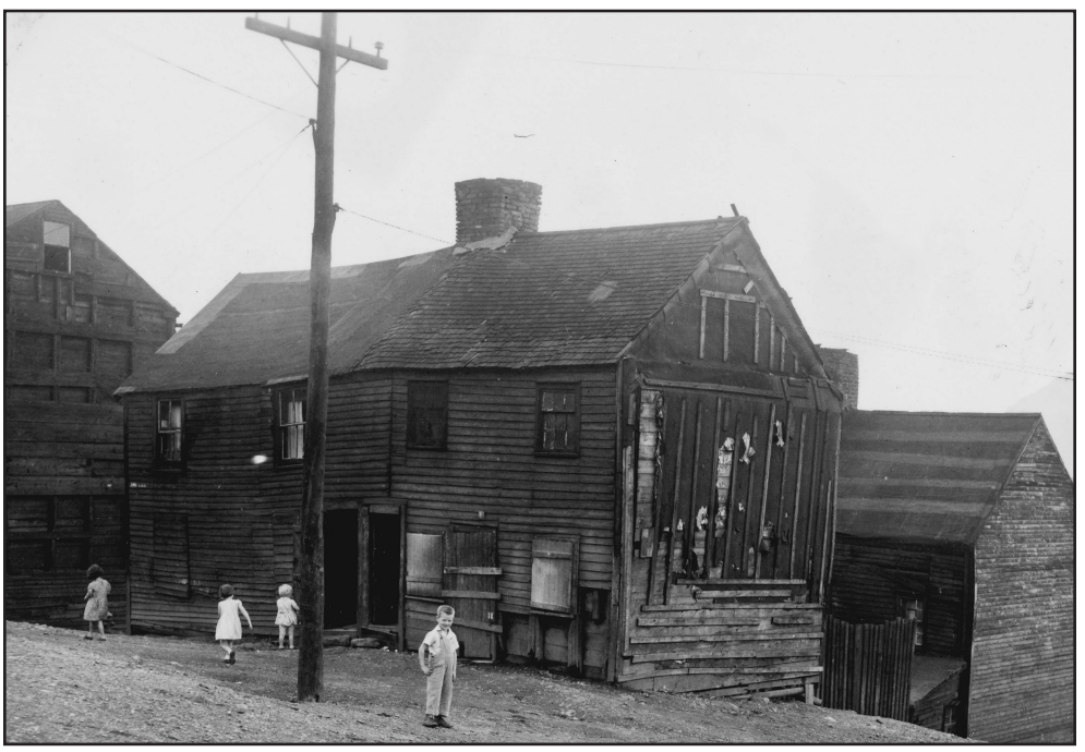
Figure 1 – Simm Street Before the Clearance