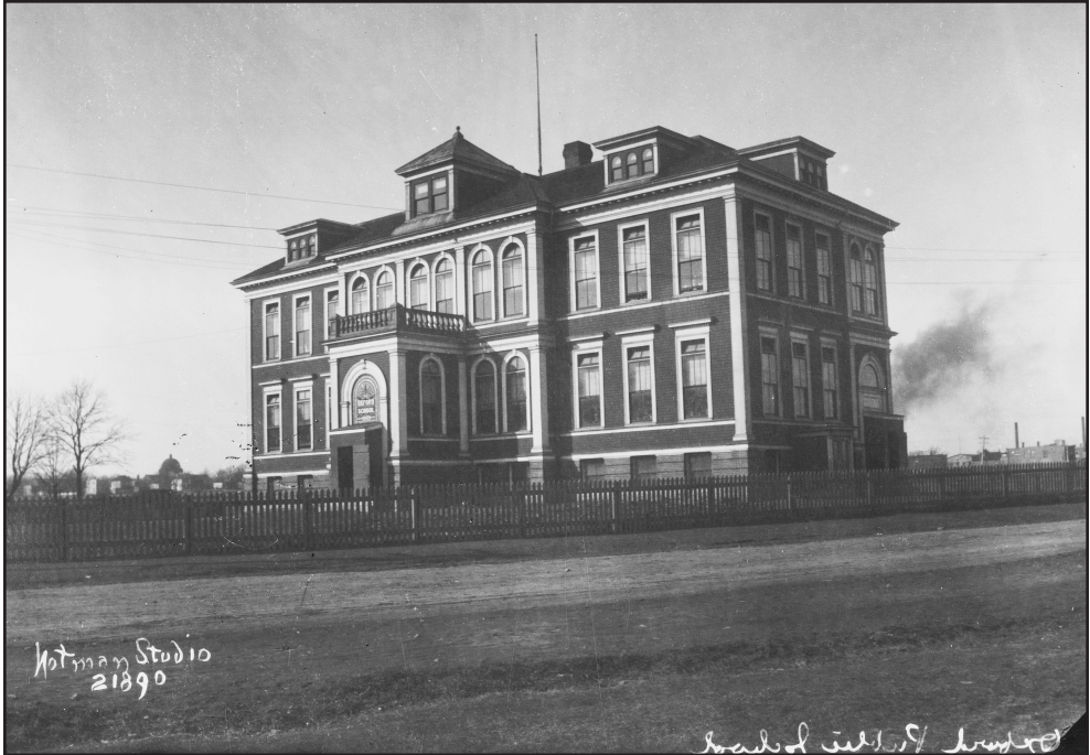
Figure 4 – Oxford Street Public School, Halifax