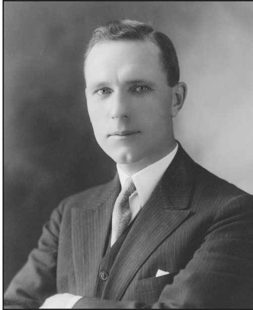
Figure 6 – Premier Angus Macdonald

Source: Harry J. Moss, photographer; Angus L. Macdonald fonds, MG 2 vol. 1502 F371, NSA.