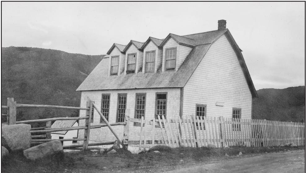
Figure 5 – School House, South Bay, Ingonish