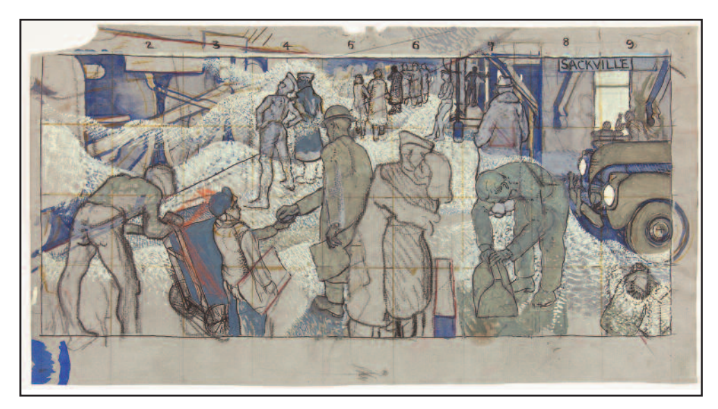
Figure 3: Alex Colville, preparatory drawing for Sackville train station mural (1942).