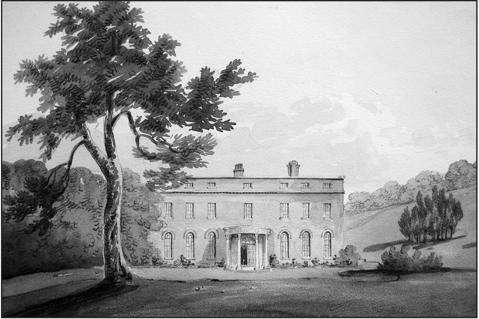
Figure 1: Side view of Juniper Hall, residence of Jonathan and Catherine Worrell, watercolour by J. Hassell, 1823.