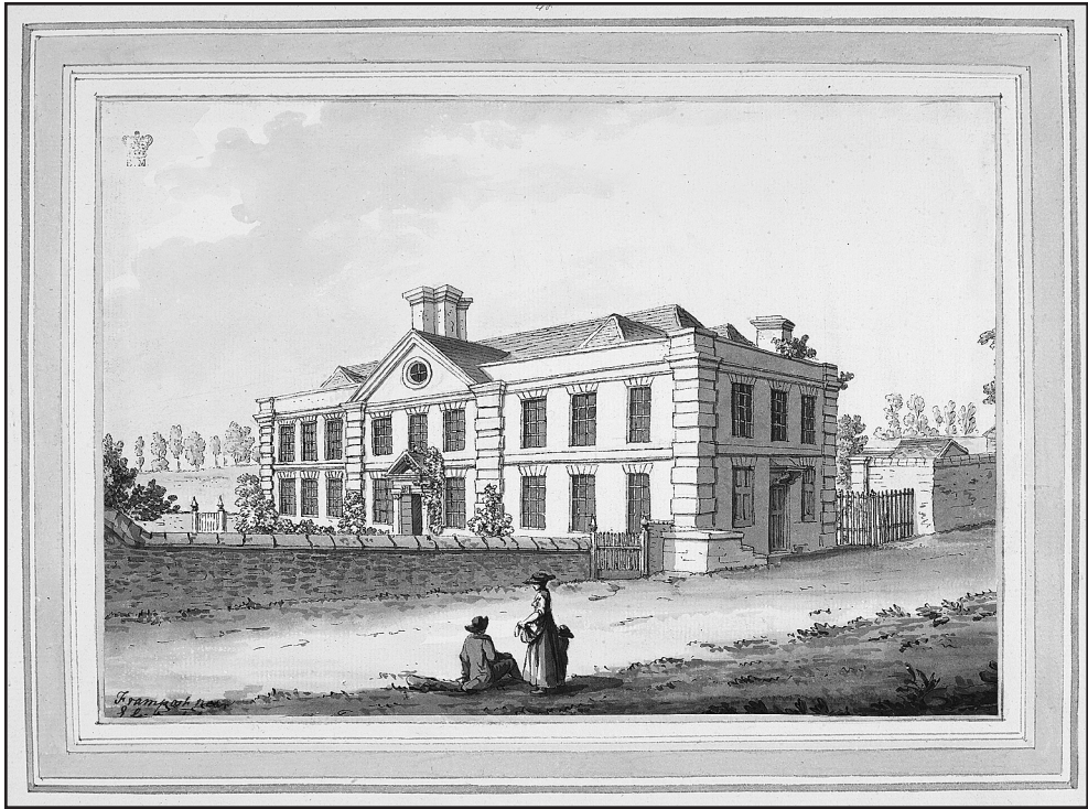
Figure 2: Frampost, residence of Jonathan Worrell Jr., watercolour by Samuel Hieronymus Grimm, 1773.