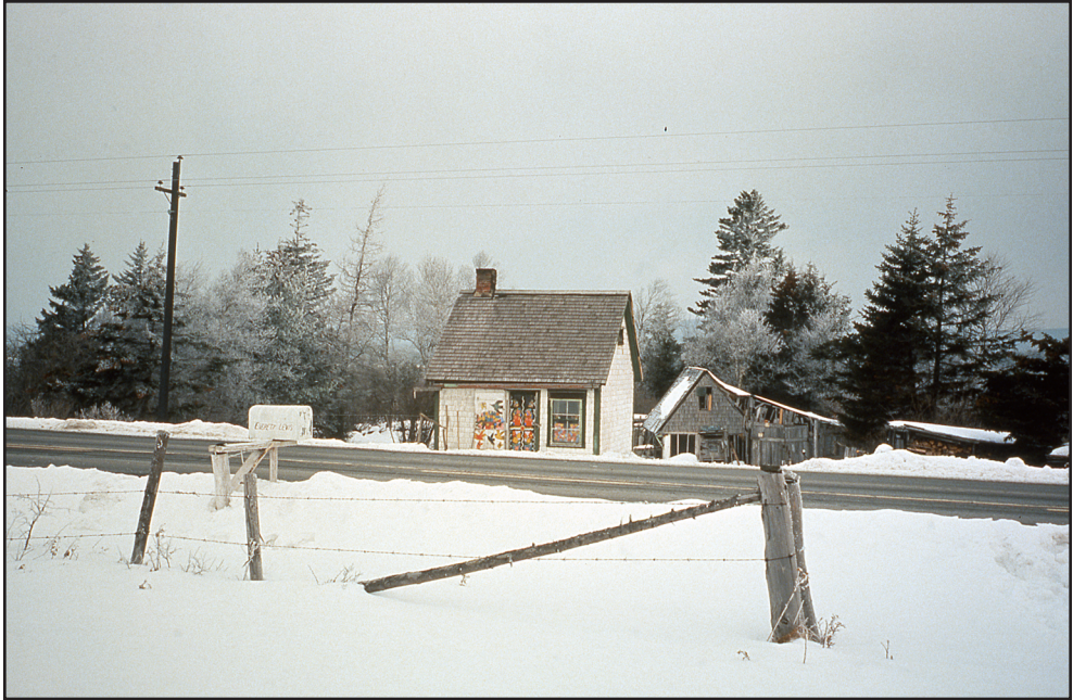
Figure 6: Lewis home, Marshalltown, Digby County, 1965.