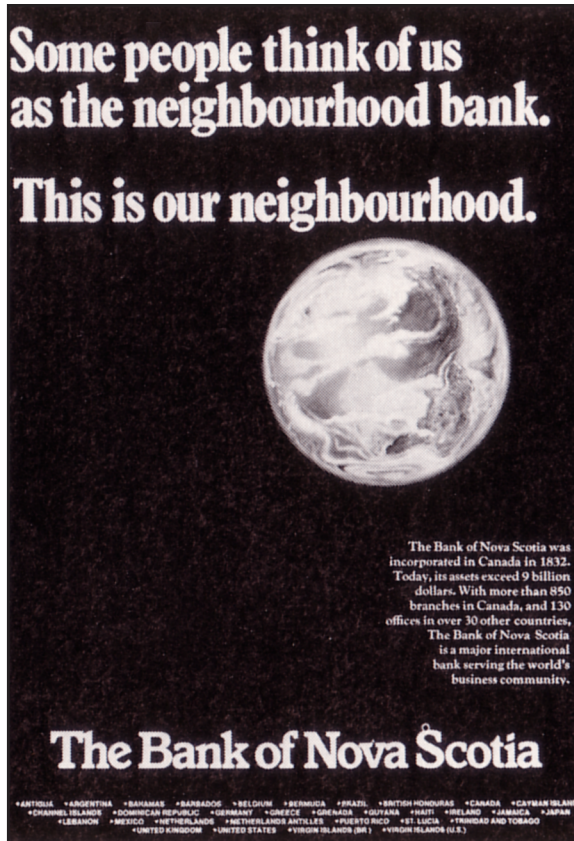
Figure 7: Scotiabank advertisement, early 1970s.