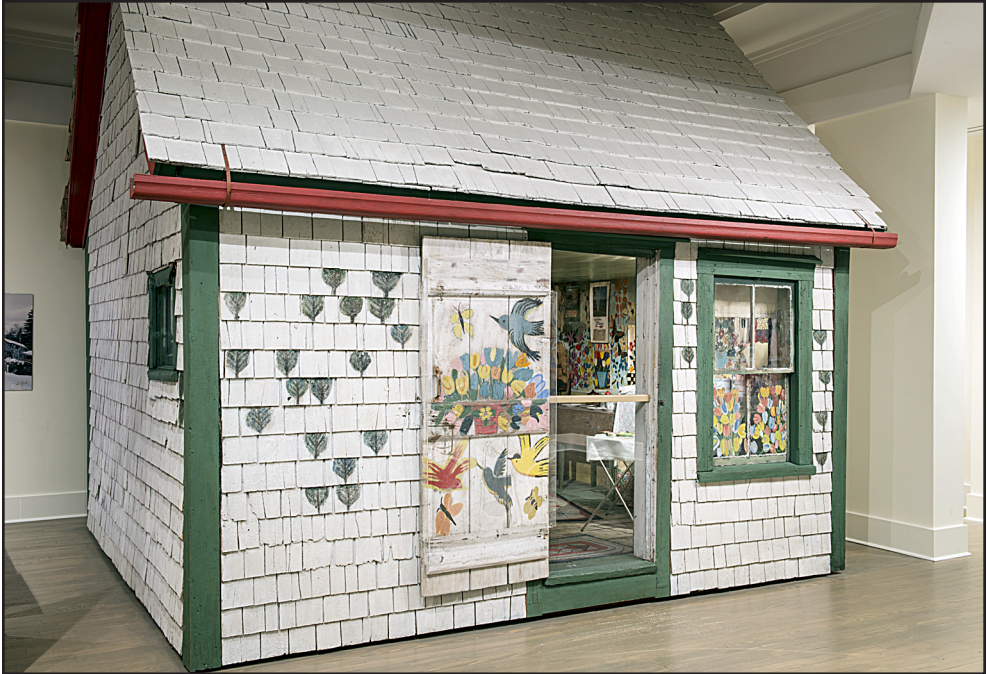
Figure 9: Installation view of the fully restored Maud Lewis House, 4 June 1998, Scotiabank Maud Lewis Gallery, AGNS, Halifax.