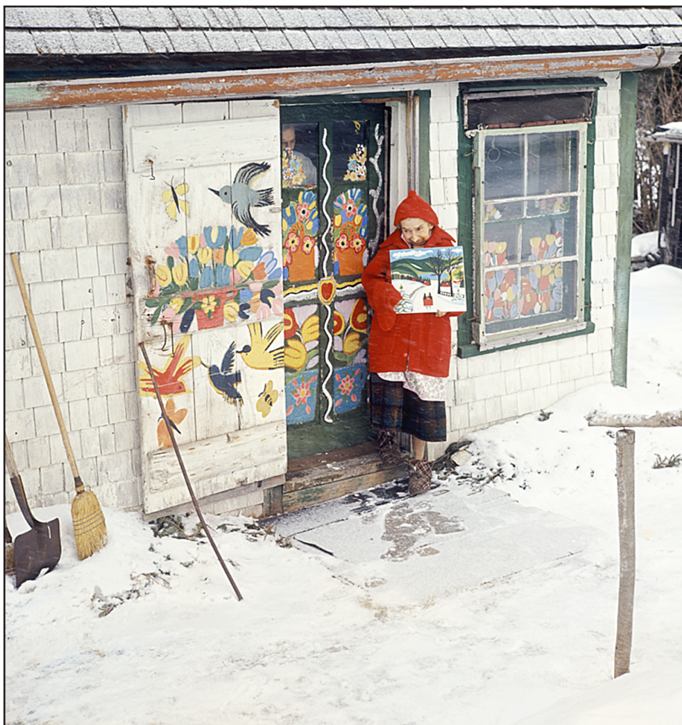
Figure 4: Maud Lewis beside storm door with hummingbird and bumblebee additions, 1965.