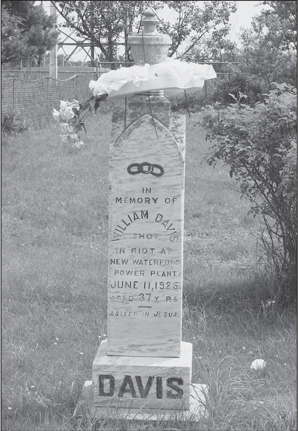
Figure 4: William Davis grave, Scotchtown.