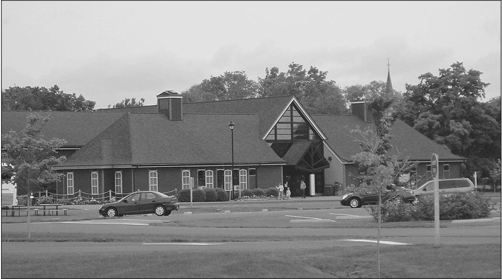
Figure 4: The Grand-Pré Interpretation Centre, 2008.

publication of Evangeline by Felix Octavius Carr Darley were placed on the walls inside the church, creating a visual narrative of the expulsion. 124