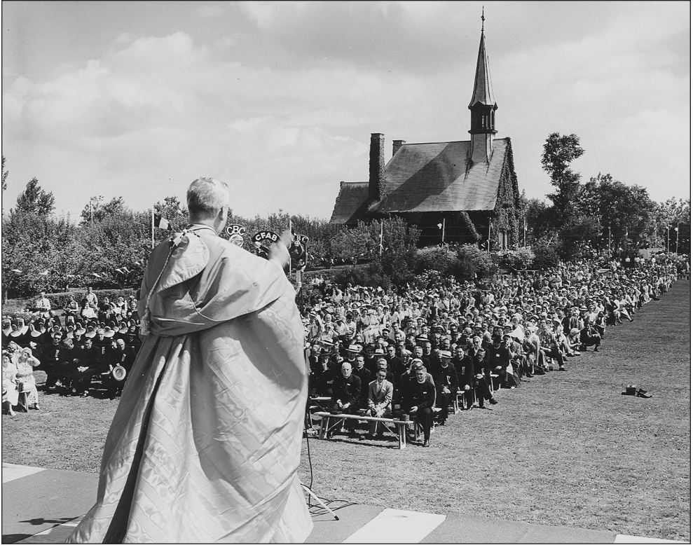
Figure 3: Pontifical Mass held at Grand-Pré during the 1955 bicentennial celebrations.

executive members of the SNA were concerned that the deal might have “grave” consequences for the Acadian peoples and were reluctant to sign over ownership of the church. 112 They would only do so if there were specific conditions to which all parties agreed. According to the final agreement signed with the SNA, the government was responsible for recognizing and emphasizing the importance of the site for the Acadian peoples and for giving the church, the museum, and all other monuments within the park a “strictly bilingual character and appearance” as manifested through the employment of bilingual guides, the use of bilingual inscriptions on objects in the museum and outside signs, bilingual information literature available to visitors, and “through all means of physical expression normally found in a national park.” The government was also responsible for properly maintaining and interpreting the objects representing the history of the Acadians. 113