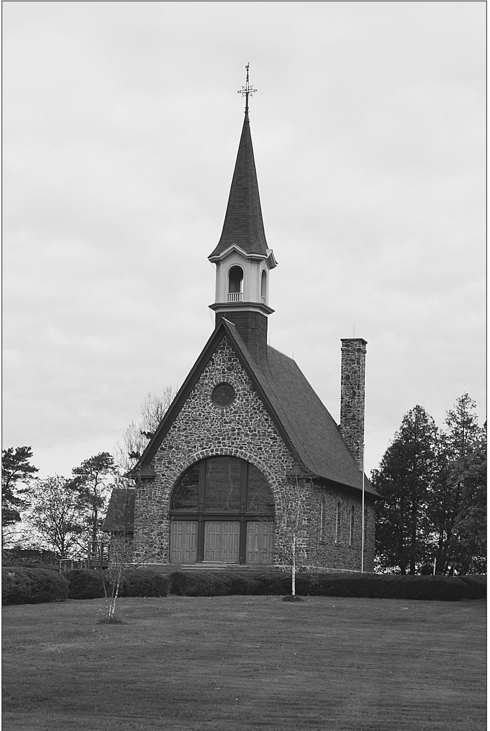
Figure 1: The Grand-Pré Memorial Church, 2008.