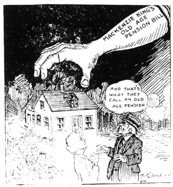
11. "Protect Them From This Sort of Thing", Halifax Herald, 9 September 1926.