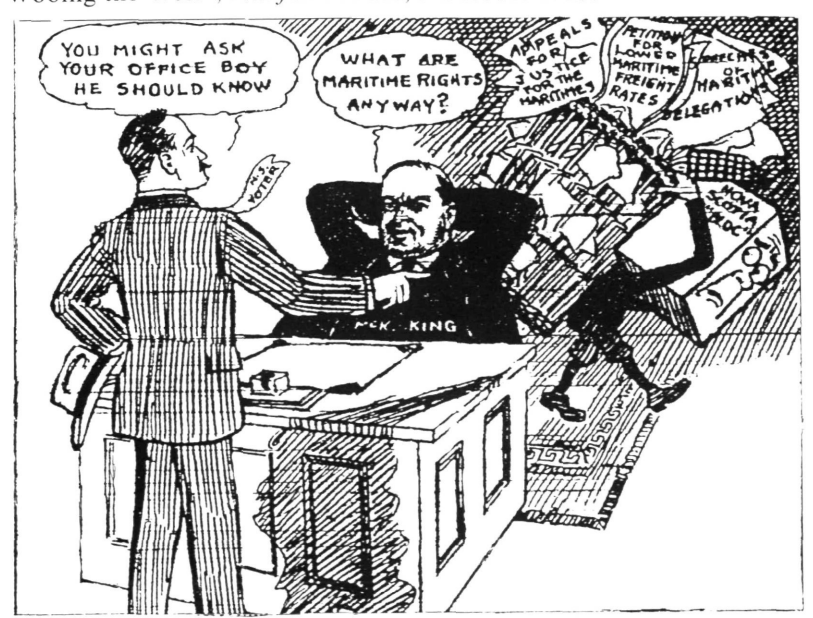
7. "What Are Maritime Rights", Halifax Herald, 22 September 1925.