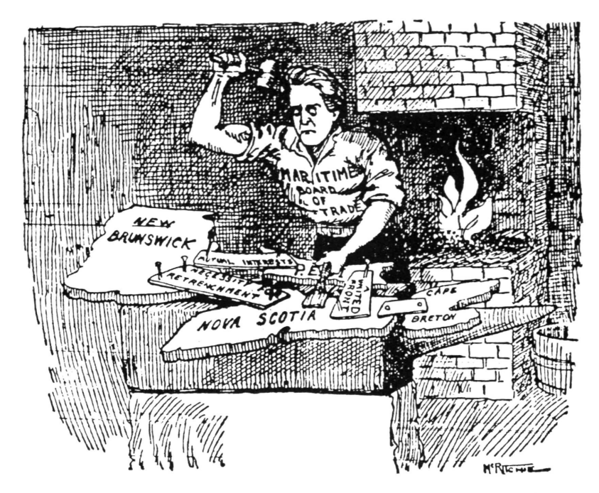
2. "Working on a Good Model", The Evening Journal (Ottawa), 21 August 1905.