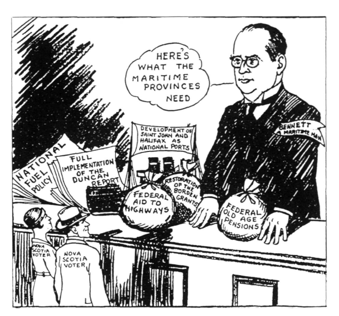
12. "Maritime Policies for Maritime People", Halifax Herald, 26 July 1930.