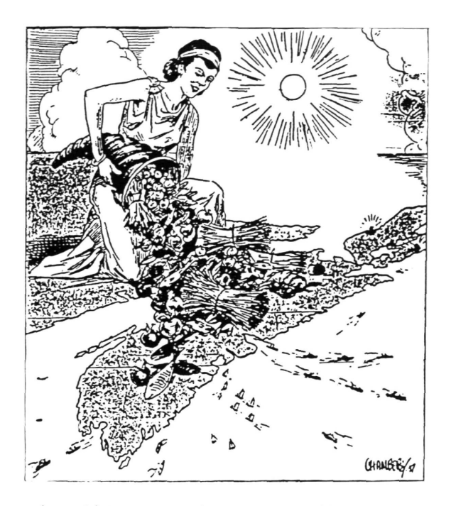
16. This illustration which appeared in the 1 July 1937 issue of the Herald kicked off Senator Dennis' Bill of Rights for Nova Scotia campaign. "The Halifax Herald", it was announced, "stands for a happy, contented and prosperous Nova Scotia within a united Canada".

were the working people of Nova Scotia. For 17 consecutive issues, readers of the Herald were treated to Chambers illustrations which called for everything from urban renewal and better highways to equal access to higher education and old age pensions. The imagery in these works was classic rather than comic in conception and bore little resemblance to the cartoon art that readers had come to expect from Chambers. The Second World War and the Cold War moved cartoonists further away from partisan venom. When newspapers amalgamated, as was the case with the Herald and Chronicle in 1948, the impetus for partisan cartoon battles was largely eliminated. Meanwhile, the embattled "little man", offering wry comment on the antics of government, business, bureaucracy and private life became a popular and enduring figure in Chambers' cartoons.