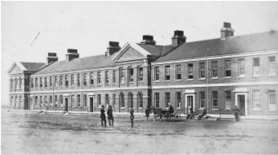
Figure Two The Officers' Quarters, Wellington Barracks, West Face, in 1863, Soon After its Completion