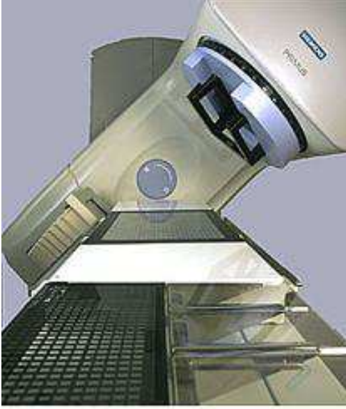
Fig. 1. A linear accelerator.