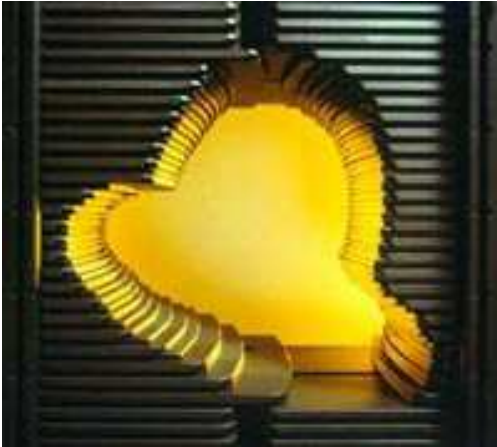
Fig. 2. Leaf pairs of a multileaf collimator.

we generalize the ideas from these references to MLCs with interleaf collision constraint.